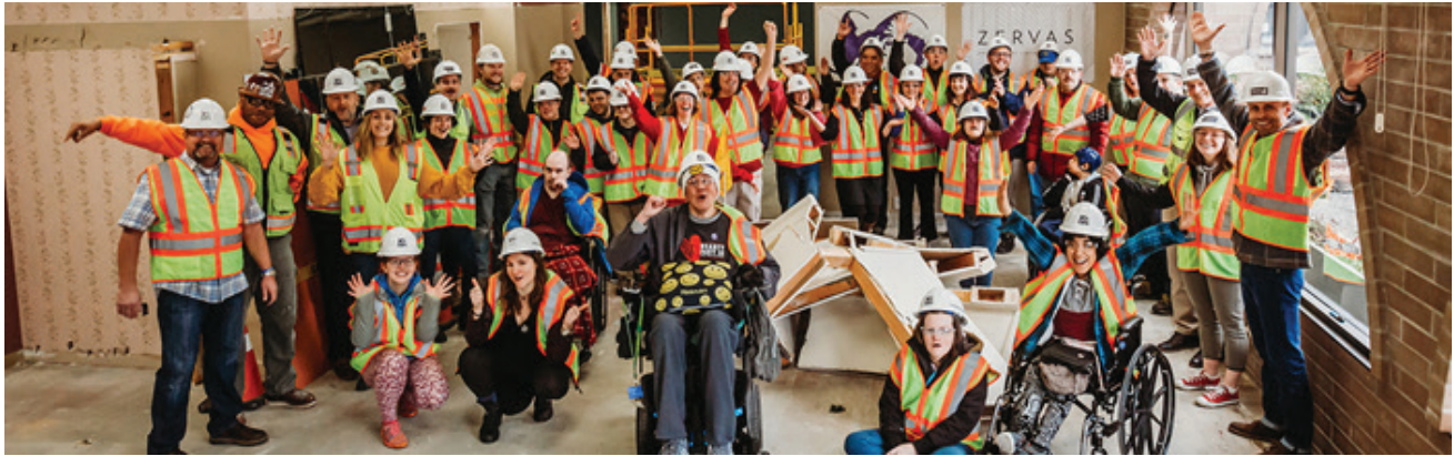
Members of the Max Higbee Center celebrate construction of their new facility.

Ten organizations shared $425,000 in Community Development grants.